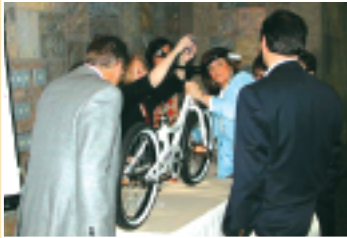
Rollins team members focus all their attention on building their bike that will be donated to Andrus Children's Center Home.

inspired by the knowledge that, win or lose, their bikes would make a huge impact on a deserving child."