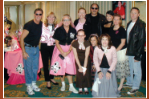
Donning their best '50s styles, HRG and FECA team members take a moment to pose among the silent auction items up for bid at the Sock Hop Gala.