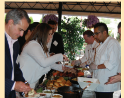
Caperberry Events Barbecue and Beer Pairing

"We were very pleased to offer this program again this year in partnership with Hospitality Resource Group, as it is important to keep our members up to date on innovative developments in our industry, The feedback after the Summit from the attendees was overwhelmingly positive"