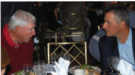
Legendary Indiana University coach Bobby Knight and former Yankee great Andy Pettite.