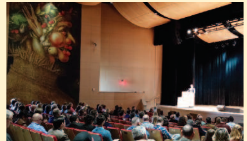
In the fall, the HVEDC Food and Beverage Alliance will bring together regional entrepreneurs to hear from industry experts on how to grow their businesses at the Culinary Institute of America in Hyde Park NY for the 4th Annual Beer, Wine, Spirits and Cider Summit.

The changing landscape of business is rapidly evolving, as major corporations including Starwood, IBM and Pepsi Bottling are downsizing and moving out, replaced by merging healthcare employers and high growth entrepreneurs. Here in the Hudson Valley, we are seeing a tremendous surge in new businesses, as smart, creative, hardworking people are coming together to promote commerce and grow our communities. One example of this trend is a new, innovative program that offers regional